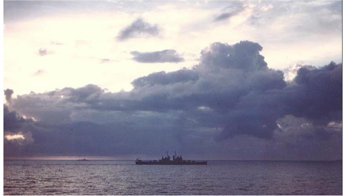
USS Santa Fe silhouetted against the Aleutians sunset, 1943