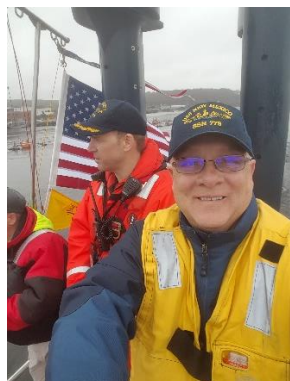
Damon Runyan on the Bridge