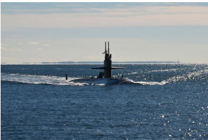
USS Santa Fe at Sea

Measuring more than 360 feet long and weighing more than 6,000 tons when submerged, Santa Fe is among the world's stealthiest platforms. Santa Fe is homeported in Pearl Harbor and is assigned to Commander, Submarine Squadron 7. It is named after the great city of Santa Fe, New Mexico.