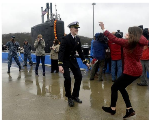
Welcome Home Hug!