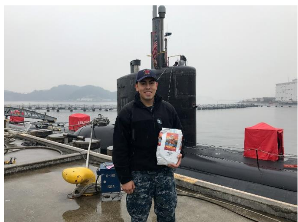
A bit of home in the form of Rio Grande Roasters Pinon Coffee!