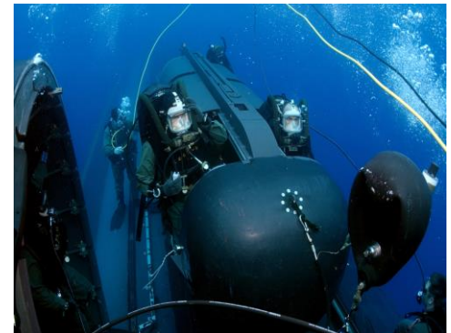
SEAL Delivery Vehicle being launched from the USS Philadelphia (SSN 690)

A SDV is a small free-flooding submersible that can transport six combat-equipped SEALs. The use of an SDV is best explained by the following quote. "Whenever it is necessary to operate near an enemy held shore in as complete secrecy as possible, the approach to the objective must be made under water. The first part of the approach can be made in a fleet-type submarine, but these 1500 ton vessels cannot operate submerged in water shallower than 60 feet, and depths less than 150 feet are considered hazardous. The final submerged approach must be made by swimming or in a small submersible." 1