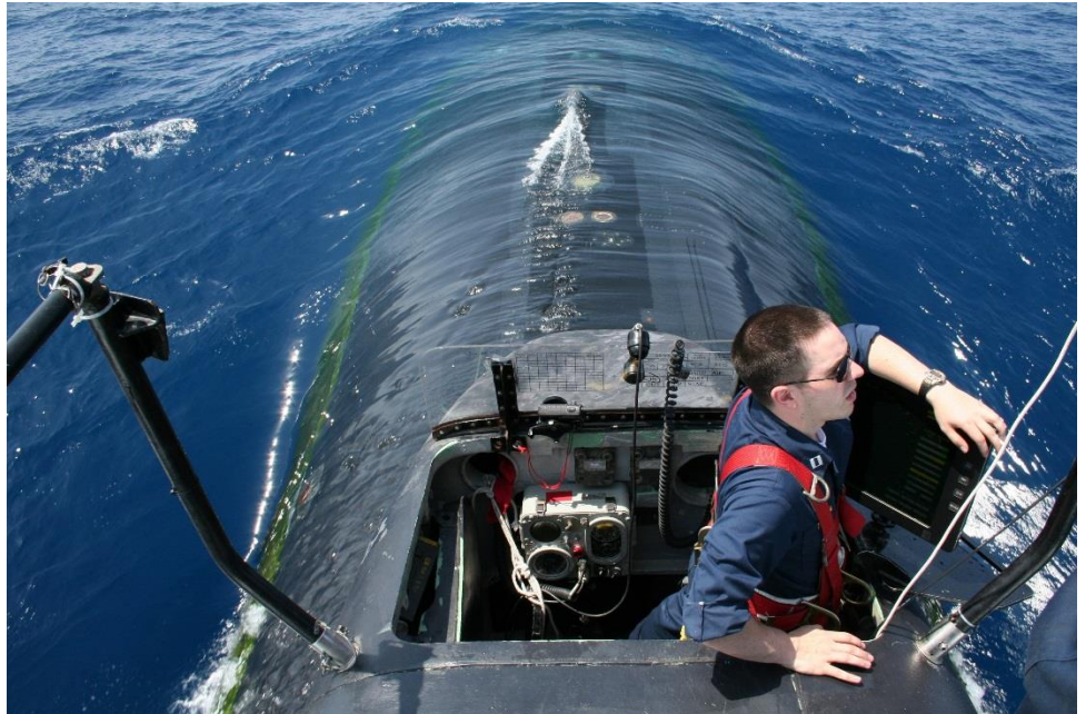
USS Albuquerque at sea

It takes a huge amount of preparation and effort to get a submarine ready to go to sea, but it's all worthwhile when you get to "station the maneuvering watch" and head out on a mission.