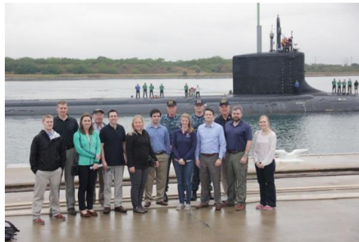
Congressional staffers and 4 New Mexicans get picked up by USS New Mexico (coming pierside)