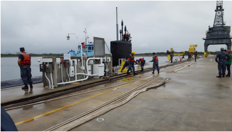
USS New Mexico moors pierside in Port Canaveral, FL – March 2016