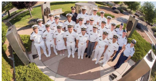
Future Leaders from Military Academies participate in Sandia National Laboratories "Military Academic Collaboration"

For the past seven years, the National Nuclear Security Administration has hosted the Military Academic Collaboration to give students at the Naval Academy, West Point, the Air Force Academy, the Coast Guard Academy, and the Merchant Marines a taste of research in the nuclear security enterprise. Sandia National Laboratories hosted the students shown in the photo at right this past summer, many of which you can see are wearing Navy uniforms. Los Alamos labs also participates in the program along with Lawrence Livermore Labs, the Pantex Plant in Amarillo, and the Kansas City and Savannah River lab sites.