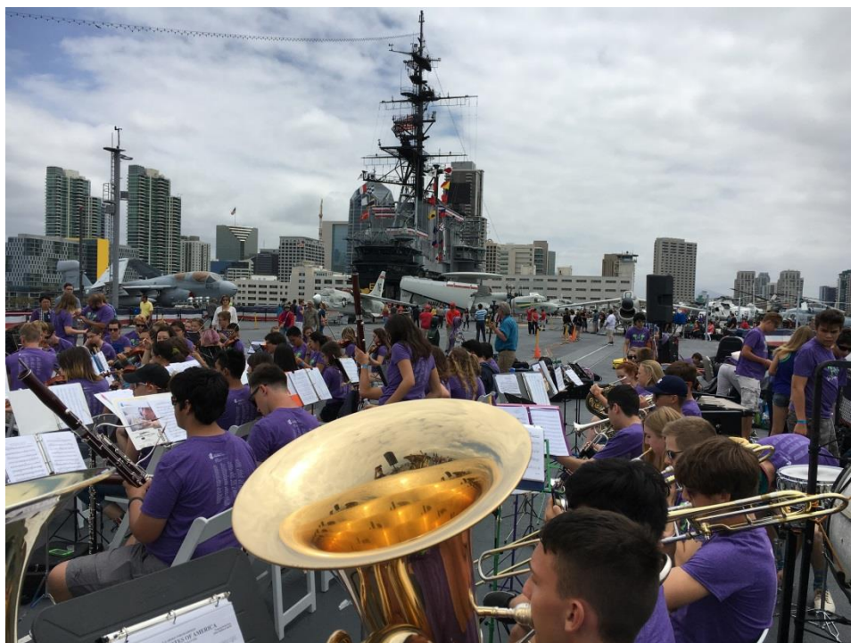
USS Midway (CV-41) Museum Ship Features the Albuquerque Youth Symphony

With a standing-room only flight deck and the San Diego clouds beginning to break to clear skies on June 12 th , the USS Midway museum ship was the featured venue for the Albuquerque Youth Symphony (AYS) and its 90+ dedicated string, woodwind, brass, and percussion players. The AYS members played their final summer concert and spent a half day on the Midway exploring its crew spaces, flight deck, hangar deck, flight simulators, climb-aboard aircraft and cockpits, "ejection seat theater", and other interactive exhibits.